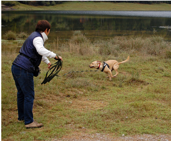
Figure 2: Image 117 was translated correctly as feminine “eine besitzerin steht still und ihr brauner hund rennt auf sie zu.” when not using the image features, but as masculine “ein besitzer ...” when using them. The English text contains the word “her”. The person in the image has short hair and is wearing pants.

size 4096 tokens, label smoothing 0.1, Adam with initial learning rate 2 and \beta_2 0.998.