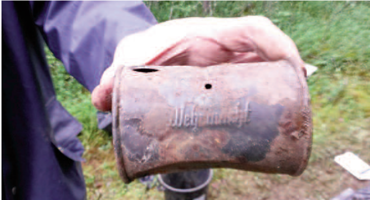
Fig. 4. A rusted can, likely part of a container for mosquito repellent, bearing the 'branding' of the German Wehrmacht , found in the forest around the outskirts of Inari.

to Finnish Lapland. Following a major Soviet assault in 1944 at the end of the Continuation War, Finland had no choice but to agree to a treaty with the Soviet Union, losing more territory and also pledging to expel the German military from its borders.