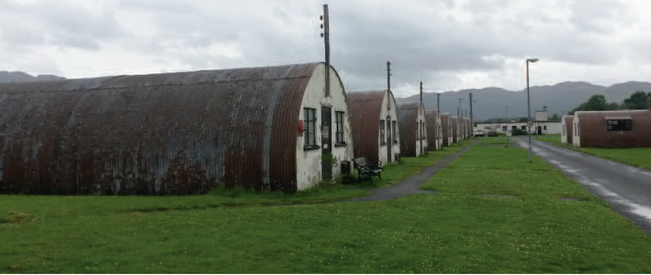
Fig. 7. Nissen huts that have survived from the Second World War period, at Cultybraggan camp.

Scottish context there has historically been a huge imbalance between private landownership and tenant communities. The opportunity to arrange community buy-outs is also connected closely to Scotland's 1997 devolution to have its own parliament, and has been heavily politicized as a result. This is because the question of land-ownership was one of the areas in which the newly-devolved Scottish government had authority and could affect change (see Thomas, Banks 2019, pp. 55-56 for a longer discussion of this). Purchases have included crofting land, and even former elite properties such as ruined castles. Among these purchases, Cultybraggan is unique so far in having a heritage connected so explicitly to WWII and to PoW incarceration in particular.