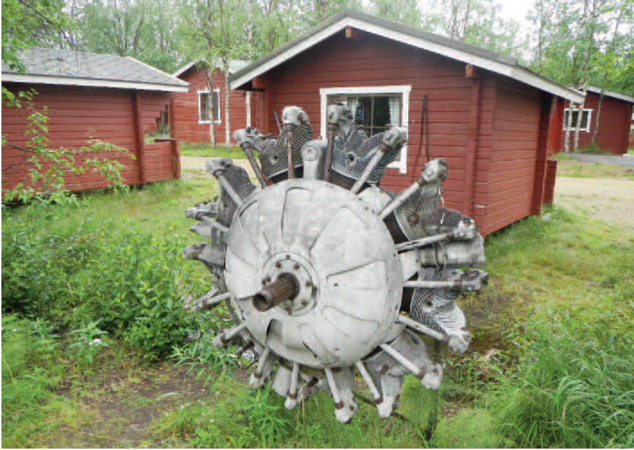
Fig. 5. Remains of an aeroplane engine from the Second World War, now experiencing a new purpose as a touristic feature mounted at a camp site in Inari.

material remnants from WWII might have 'value beyond their financial value as scrap metal' (Thomas et al. 2016, p. 339). Aside from this brief organizational interaction with the physical remains, we also found through our research that individual people also engaged with WWII material – for example developing personal collections of militaria, or repurposing larger objects as touristic features at camp sites (fig. 5) or other privately-run attractions. We also found that the popular semi-digital exploration pastime of geo-caching had taken advantage of several WWII sites in Finnish Lapland as exciting places for geo-cachers to explore.