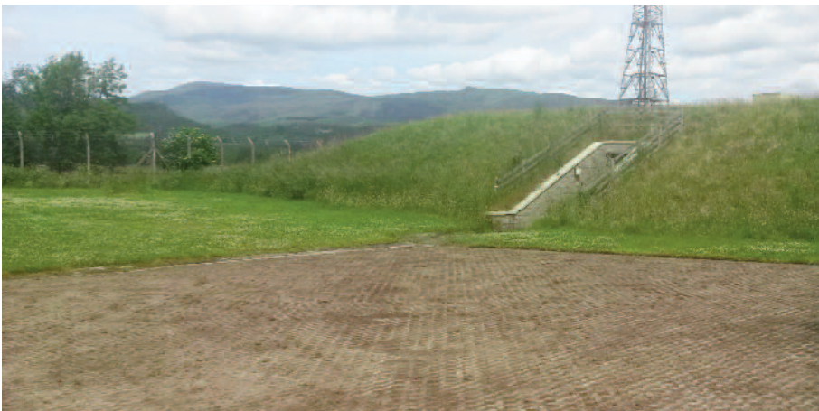
Fig. 6. The nuclear bunker at Cultybraggan camp.

In 2007, following local debate and a referendum over the previous two years, the village of Comrie elected to purchase the site as a community venture. In Scotland, this is a fairly common process that many communities have enacted for local purchase through the Land Reform (Scotland) Act 2003, and the later 2016 revision of that law. As others have discussed at length (e.g. Chevenix-Trench, Philip 2001), in the