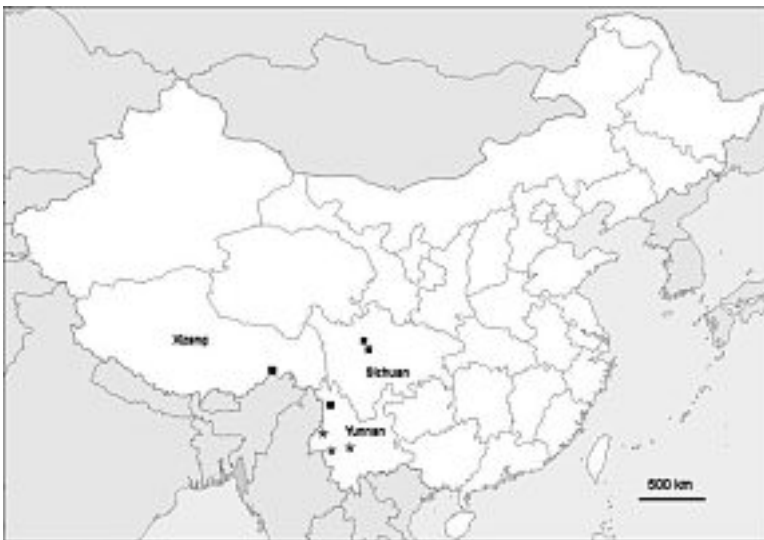
Fig. 2. Distribution of Neckera himalayana (stars) and N. xizangensis (squares) in China. Based on examined specimens cited in the text and Enroth & Ji (2010). Original base map URL: https://commons.wikimedia.org/wiki/Category:Blank_maps_of_China#/media/File:LocationmapChina2.png

Wu (2011) considered N. xizangensis to be “close to what I consider to be N. pennata Hedw. in Bryoflora of Xizang ” (Li, 1985: 281, 282). In my opinion, the clearest distinction between the two species is the presence of paraphyllia in