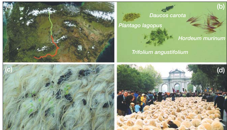
Figure 1. Phases of the experiment. (a) Route followed by merino sheep flock before (green) and after (red) application of seeds to fleece of focal animals. (b) Marked seeds in the lab. (c) Marked seeds on fleece. (d) Flock used in the experiment crossing Madrid city center.

To determine the persistence of the propagules on the